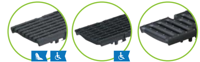
Ductile iron longitudinal grating cl. C