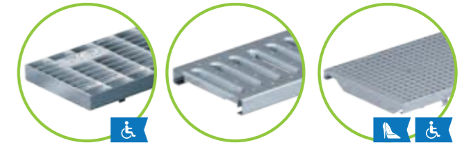
Mesh grating cl. B / C